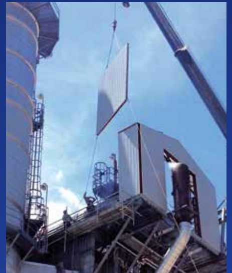
Steel Building Erection OG&E – Luther, OK