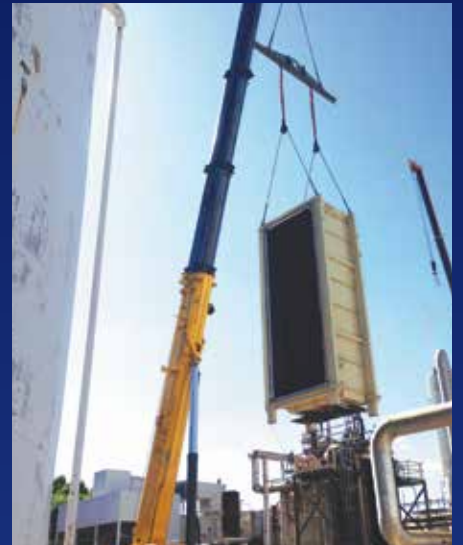
Economizer Module Replacement Praxair – Hawkins, TX