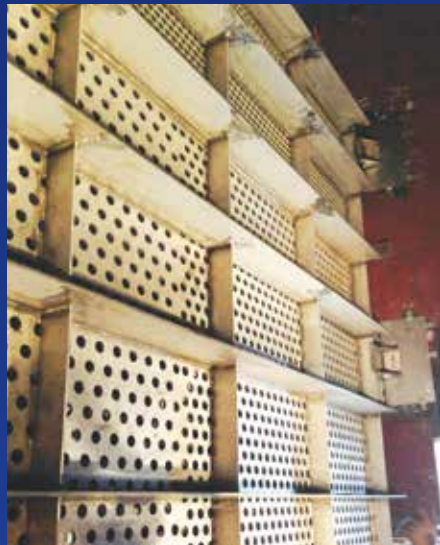
Flow Grid Installation Dow Chemical – Freeport, TX