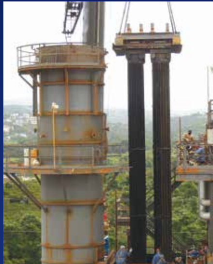
Economizer Coil Replacement Jamaica Power