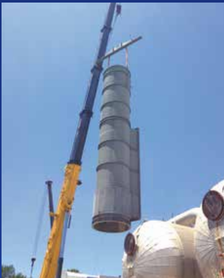
HRS Stack Replacement Praxair – Hawkins, TX