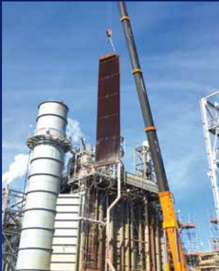
HP Economizer Coil Replacement Calpine – Baytown